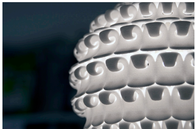
Cresco Hanging light – detail