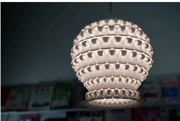
Cresco Hanging light in office