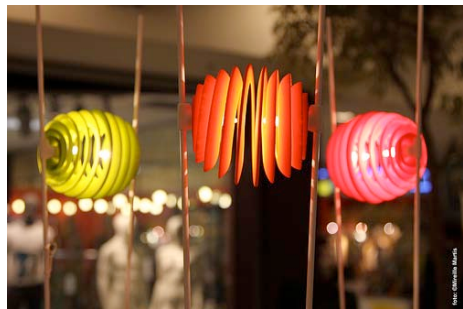
Filament lamps, FOC

All images are available as high resolution files.