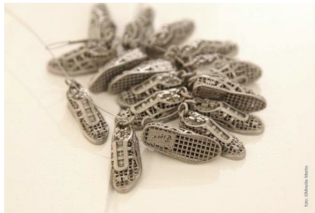
"Electric Light Shoe" project, gadgets, FOC