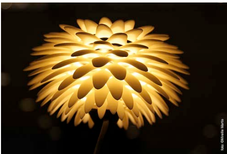
Palm light, FOC