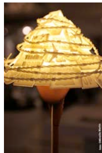
Riot lamp, FOC