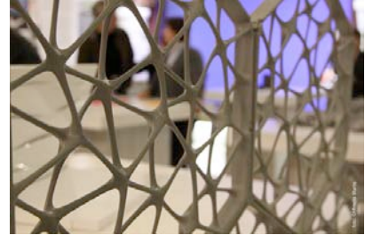
Macedonia space divider