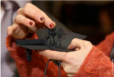
The black box, ring+hands, V. de Bie