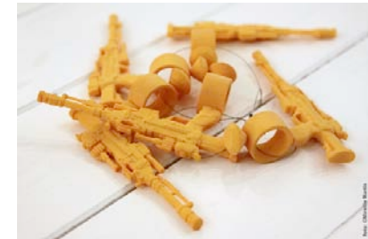
"Haunted by 36 women" series, T. Noten