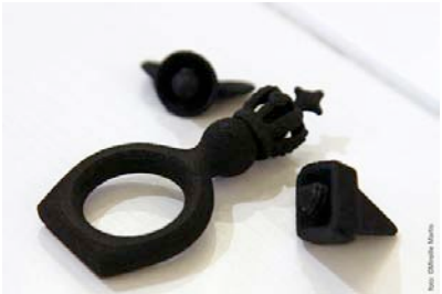
The black box, ring, V. de Bie