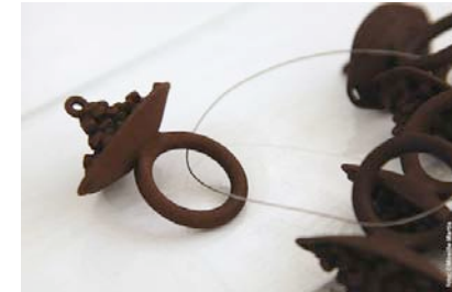
"Haunted by 36 women" series, T. Noten