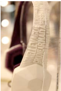
Street Headphones, FOC