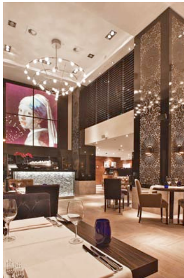
#3: FOC's sparkling Palm chandelier creates delicate accents and reflections