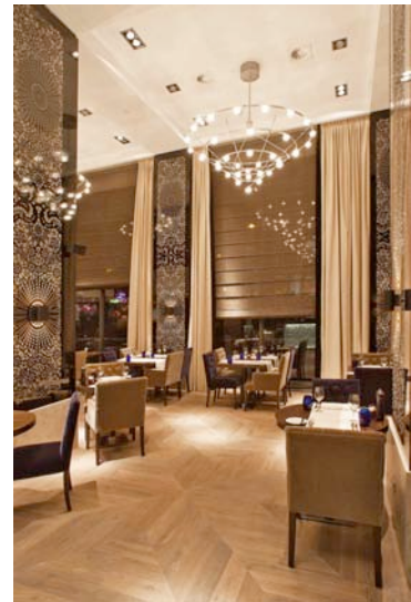
#4: At Hilton The Hague's Grand Café Pearl, FOC's Palm chandelier creates a glamour atmosphere