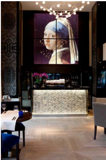
#2: Grand Café Pearl with Vermeer's "Girl with a Pearl Earring"; on top in the center: FOC's Palm chandelier

For further editorial information, including request for high resolution images, please contact the FOC Press Office at: foc-press@bt-media.net