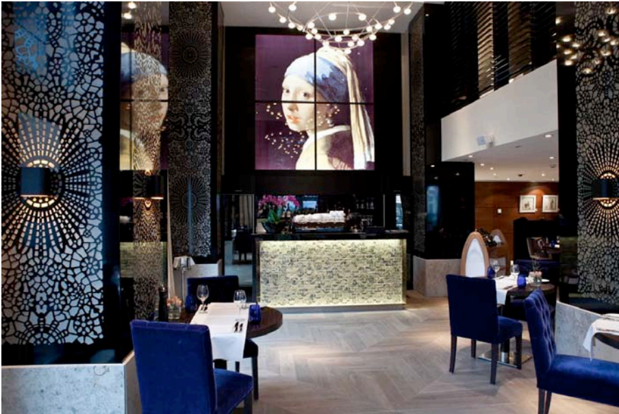
#1: Grand Café Pearl at Hilton The Hague is dominated by Vermeer's "Girl with a Pearl Earring"; on top in the center: FOC's Palm chandelier; further references to Dutch craftsmanship: Delft Blue tile cladding the counter and traditional lace patterns on the columns

(High resolution images on request to: foc-press@bt-media.net )