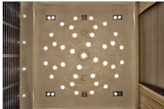
#6: a view towards the ceiling offers a special perspective on FOC's Palm chandelier