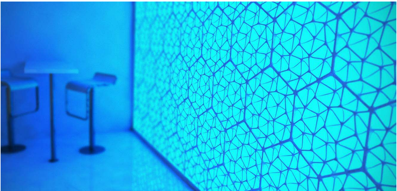
#1: floor-standing installation within a predefined frame

(High resolution images on request to: foc-press@bt-media.net )