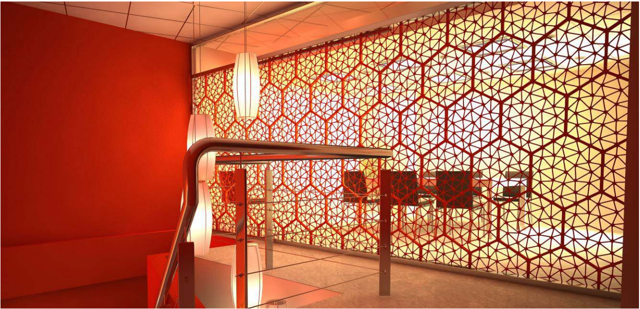
#3: floor-standing installation within a predefined frame