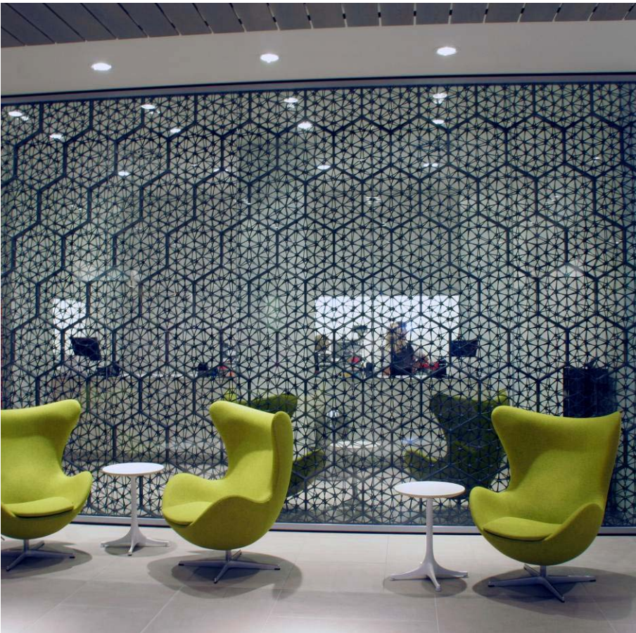
#4: double layer between two layers of glass