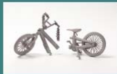
06_FOC_ASICS_Bike 2 parts.jpg