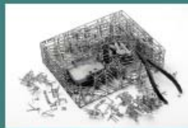
04_FOC_ASICS_Break 4 pliers.jpg