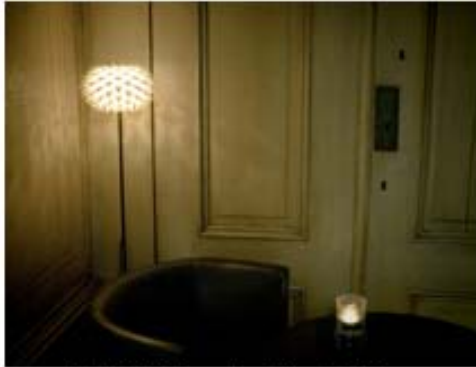
FOC_Palm standing light.jpg

For further information and high resolution images, please send request to: < foc-press@bt-media.net >