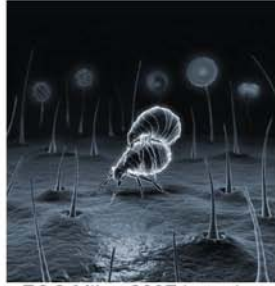
FOC Milan 2007 bugs.jpg

(High resolution images available. Please indicate file name and send requests to: < FOC-Press@bt-media.net >)