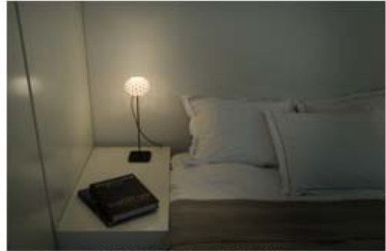
FOC_Palm table light.jpg