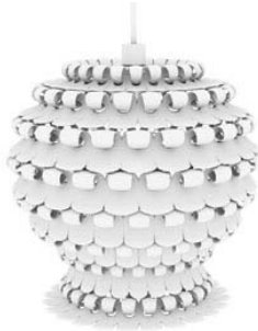
Render of Cresco lamp by Pekka Salokannel for FOC Cresco lamp is the winner of the FOC Q3-2010 Talents challenge