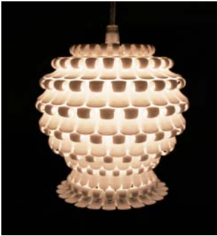
Cresco lamp by Pekka Salokannel for FOC Cresco lamp is the winner of the FOC Q3-2010 Talents challenge

About Cresco, Salokannel comments: "While searching for organic forms in nature, I was looking at how plants work. I wanted to find rather systems than shapes to copy. One basic rule is that nature doesn't create a straight line - humans do. Sometimes plants work seemingly mathematically and usually they repeat themselves. They multiply, for example mushrooms have their networks underground or the same type of trees creates forests. Cresco is Latin and means to multiply. My lightning designs take inspiration from nature and combine other ideas and forms together. It represents the variety in nature's organic forms."