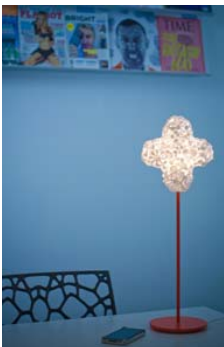
#3: Karim Rashid's Cross table lamp for FOC

"CROSS Lamp": A suggestive "cross-shaped" lamp - available in suspended and table versions - made up of the combination of Karim Rashid's most memorable icons. The cross form is Karim Rashid's symbol for Globalove.