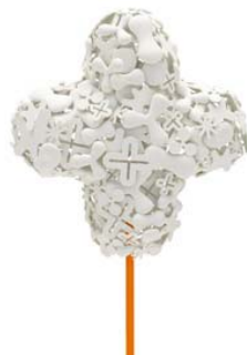
#5: Karim Rashid's Cross table lamp for FOC