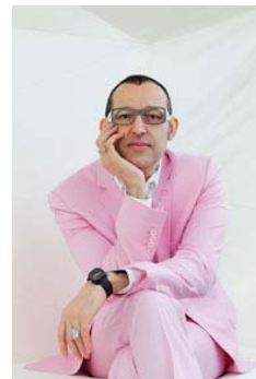
Karim Rashid