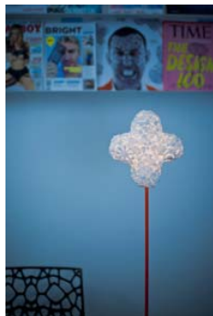
#4: Karim Rashid's Cross standing lamp for FOC