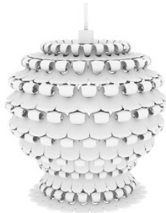
Render of Cresco lamp by Pekka Salokannel for FOC Cresco lamp is the winner of the FOC Q3-2010 Talents challenge