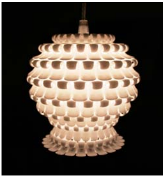
Cresco lamp by Pekka Salokannel for FOC Cresco lamp is the winner of the FOC Q3-2010 Talents challenge

About Cresco, Salokannel comments: "While searching for organic forms in nature, I was looking at how plants work. I wanted to find systems rather than shapes to copy. One basic rule is that nature doesn't create a straight line - humans do. Sometimes plants work seemingly mathematically and usually they repeat themselves. They multiply, for example mushrooms have their networks underground or the same type of trees create forests. Cresco is Latin and means to multiply. My lighting designs take inspiration from nature and combine other ideas and forms together. They represent the variety in nature's organic forms."