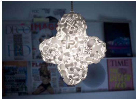
#2: Karim Rashid's Cross suspension lamp for FOC

"CROSS Lamp": A suggestive "cross-shaped" lamp - available in suspended and table versions - made up of the combination of Karim Rashid's most memorable icons. The cross form is Karim Rashid's symbol for Globalove.