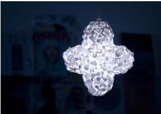
#1: Karim Rashid's Cross suspension lamp for FOC

"I thought to make a hyper-collage of my icons as a lit object, in changing scale and mass to create diverse shadows and light filtration, to really make one overriding blobular 3-d cross form, which is my symbol for Globalove," says Karim Rashid about his astonishing "Cross" table, floor and suspension lamp designed for FOC. The 3D Cross is composed of an infinite number of small icons alluding to Karim's most famous and iconic forms.